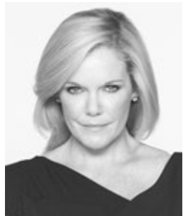
Maura West stars as "Ava" on "General Hospital"

GENERAL HOSPITAL Valentin had a tense run-in with Ava. Jordan pushed Stella for more information. Alexis looked for closure. Finn's interest was piqued. Hayden apologized to Curtis. Lucy approached Sasha. Cameron offered Josslyn his support. Sonny appre-