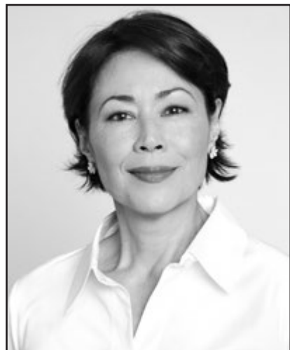
Ann Curry hosts "Chasing the Cure," premiering Thursday on TBS and TNT.

The Emmy-winning news correspondent, former "Today" co-anchor and re-