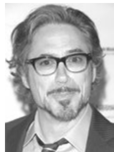
Robert Downey Jr.

million, five Oscar wins (including Julie Andrews) and a best-picture nomination, while "Mary Poppins Returns" cost $30 million and grossed $345 million. It didn't win any Oscars and didn't get a best-picture nomination. One of reasons may have been no hit songs. The original had at least four hits: "A Spoonful of Sugar," "Chim Chim Cher-ee," "Jolly Holiday" and "Supercalifragilistic-expialidocious." No hummable tunes, no repeat business.