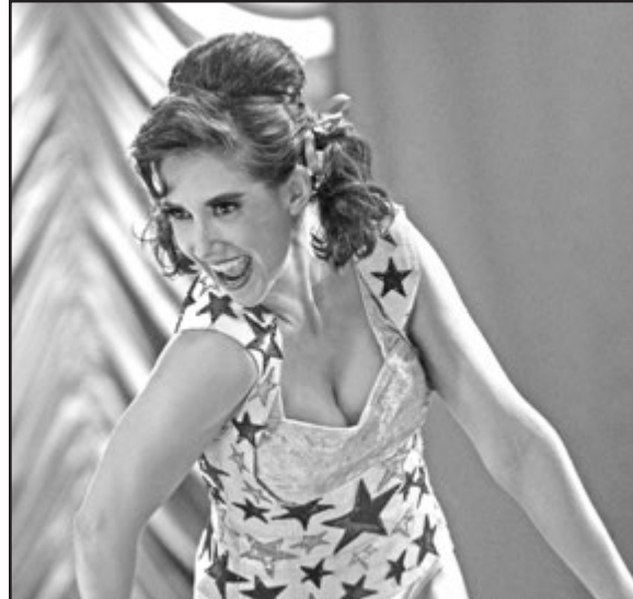
Ann Curry hosts "Chasing the Cure," premiering Thursday on TBS and TNT.

It's Viva Las Vegas for the ladies of "GLOW," although some aren't all that enthused, as Season 3 of the '80s-set wrestling dramedy opens this week on Netflix.