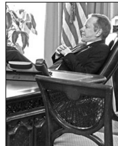
Kiefer Sutherland stars in the new Season 3 of "Designated Survivor," which begins streaming Friday on Netflix.

Netflix already had the rights outside North America to the drama about a sud-