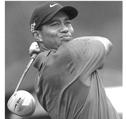
GOLF 7 p.m. PGA Tour Golf RBC Canadian Open. Second Round.

GOLF 6 a.m. European PGA Tour Golf GolfSixes Cascadis. Day 1. (N) (Live) GOLF 9:30 a.m. PGA Web.com Tour Golf BMW Charity Pro-Am. Second Round. (N) (Live) GOLF 12 p.m. LPGA Tour Golf ShopRite Classic. First Round. (N) (Live) GOLF 3 p.m. PGA Tour Golf RBC Canadian Open. Second Round. (N) (Live)