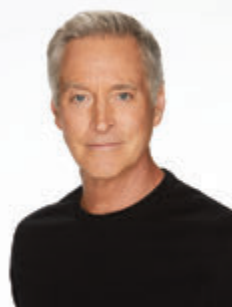
Drake Hogestyn stars as "John" on "Days of Our Lives"

DAYS OF OUR LIVES John offered to help Marlena find Rolf's diary. Claire blamed Eve for Tripp breaking up with her. Ben had a tense run-in with Eve. Jack made a surprising move with his first appointment as mayor. JJ and Haley enlisted Tripp's help to evade the authorities. Eve set out to punish Ben. Meanwhile, Ben became more suspicious of Claire. JJ and Haley grew closer while taking refuge at the Horton cabin. Lani made a confession to Rafe. After Holly's funeral, Nicole lashed out at Eric, Sarah and Maggie. Doug and Julie celebrated their 25th wedding anniversary. Chloe discovered Gabi and Stefan in bed. Wait to See: A major secret is