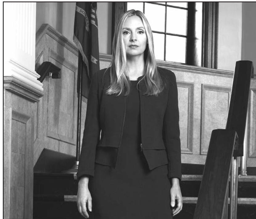
Hope Davis stars in "For the People," premiering Tuesday on ABC.

"I was lucky enough to follow around the public defender of Los Angeles," Davis says, "and I was so inspired by how committed they are to their job, whether the odds are stacked against them or not. They're fierce and they're fighters. They are so passionate about it, and they wouldn't trade their jobs for anything. So that's kind of the way I'm approaching it."