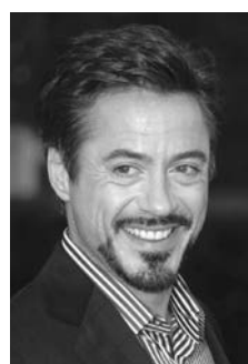
Robert Downey Jr.

HOLLYWOOD — "Doctor Dolittle" was originally a 1967 film with Rex Harrison. Harrison was fresh off his Oscar win for "My Fair Lady" (1965), and "Dr. Dolittle," which also starred Samantha Egger and Anthony Newley, was a dismal flop. It cost $17 million and made only $9 million. 20th Century Fox tried again in 1998 with Eddie Murphy, and the sequel grossed $294 million. Another sequel in 2001, also with Murphy, grossed $176 million. Now, Universal Studios has acquired the rights and are making "Voyage of Dr. Doolittle" with Robert Downey Jr. in the title role. ***