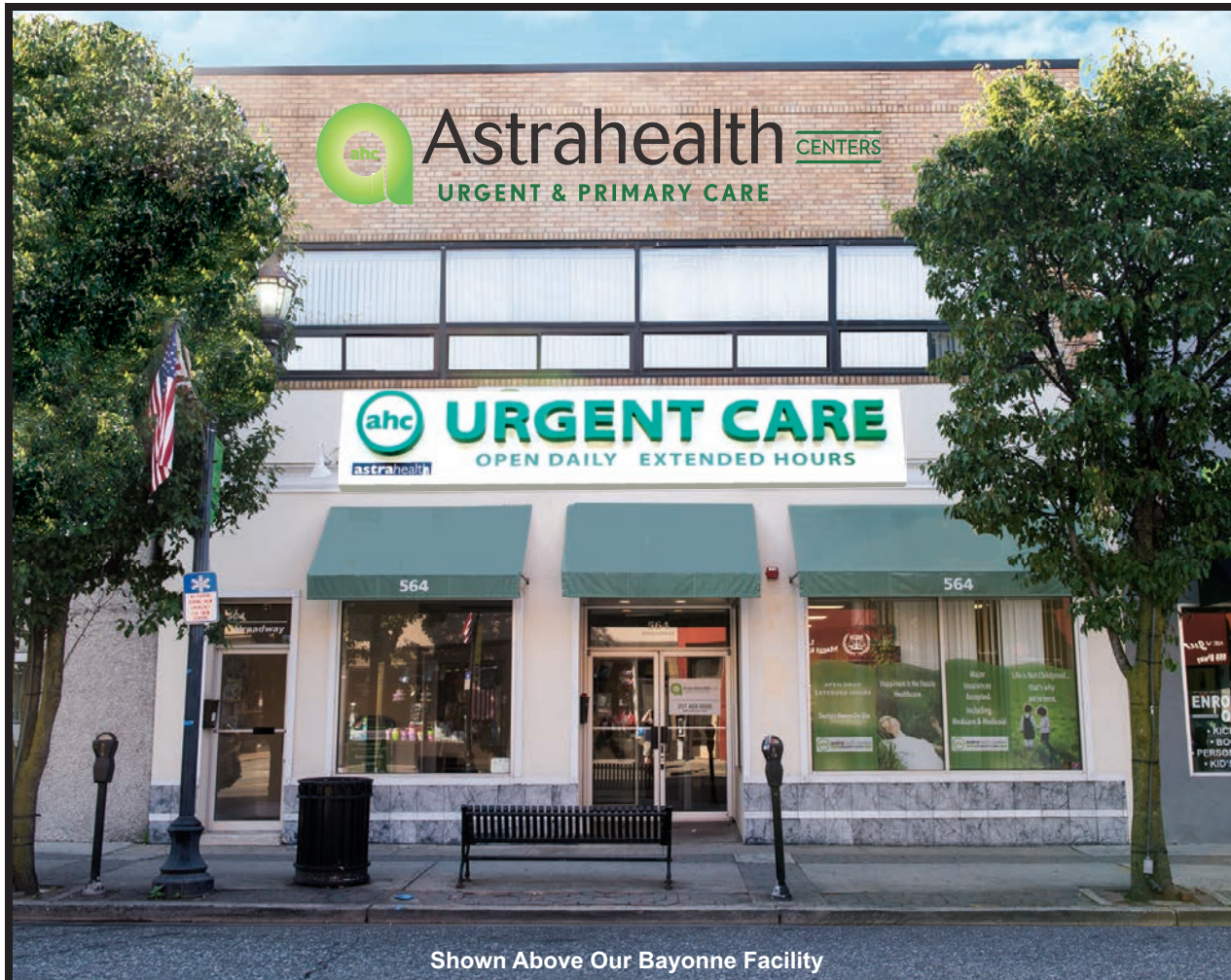
Shown Above Our Bayonne Facility