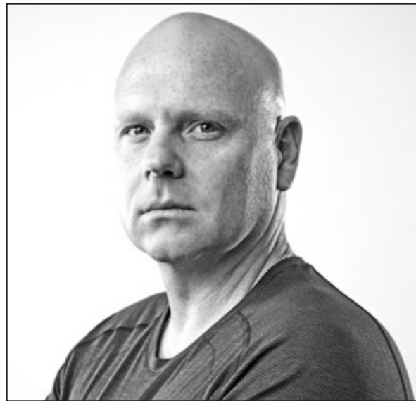
"Volcano Live! With Nik Wallenda" airs Wednesday on ABC.

Nik Wallenda regards himself as an artist who makes himself the centerpiece of a much larger canvas. And in his latest performance, it's one that contains all the el-