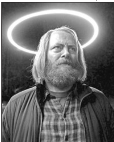
Nick Offerman stars in the fantasy-mystery series "Devs," premiering Thursday on FX on Hulu.

The filmmaker has done that with his challenging and well-received movies "Ex Machina" and "Annihilation," and