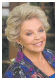
Susan Seaforth Hayes stars as "Julie" on "Days of Our Lives."

DAYS OF OUR LIVES Lani crashed Gabi and Eli's wedding. Julie collapsed. Sonny and Will separately recalled their last Valentine's Day together. Doug reflected on his 50 years in Salem. Rafe arrested Gabi. Lani attempted to explain her actions to Eli. Jennifer received some sad news about a loved one. Kayla was shocked by "Steve's" revelation. Hattie and Roman shared a sweet moment. Rafe and Justin tried to track down Kayla. Kristen had an unsettling dream about Rachel. Sarah received some hopeful news about Mackenzie. Ciara told Ben her theory about Jordan's killer. Will questioned Maggie about the night of the accident. Sarah was shocked when she learned the identity